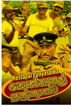
Figure 13: Example of an ambiguous ad image we encountered on a movie sharing forum in Sri Lanka as part of the its table of contents.